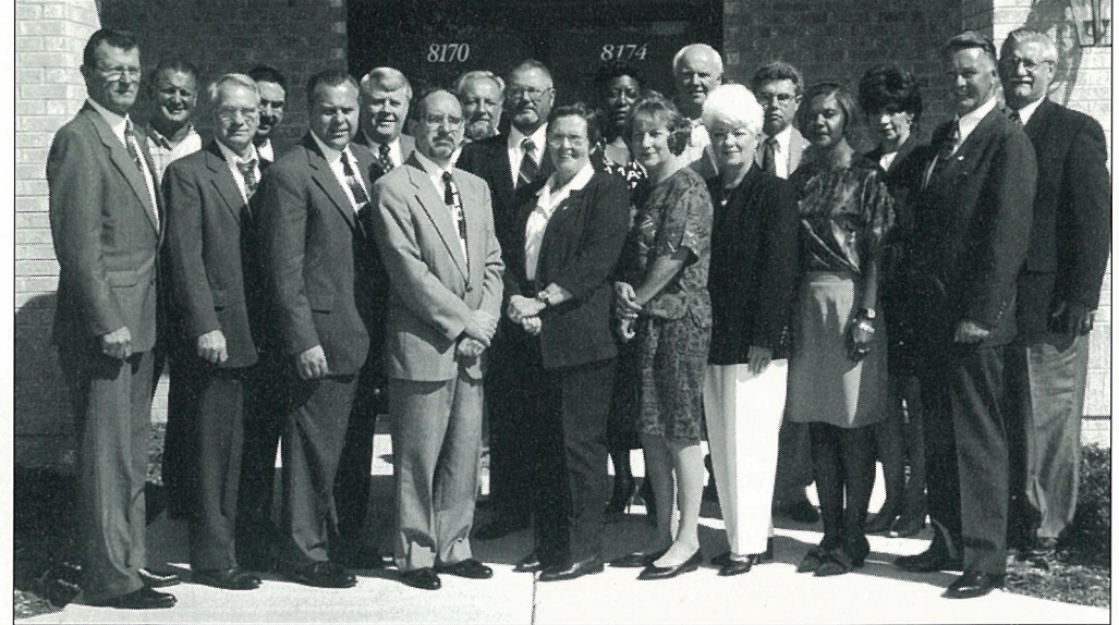
Local 21 Officers, Executive Board and Assistant Business Managers, and IBEW 6th District International Representatives are pictured after signing the Local 21 Charter.

During the next few months, as the structure and organization of the new local union are put in place, Local 21 will keep you, the member, as up to date as possible. Although we're bound to make a few mistakes along the way, we hope you'll demonstrate your support for Local 21. Now is the time for all of us to work together to build an effective, united and powerful local union.