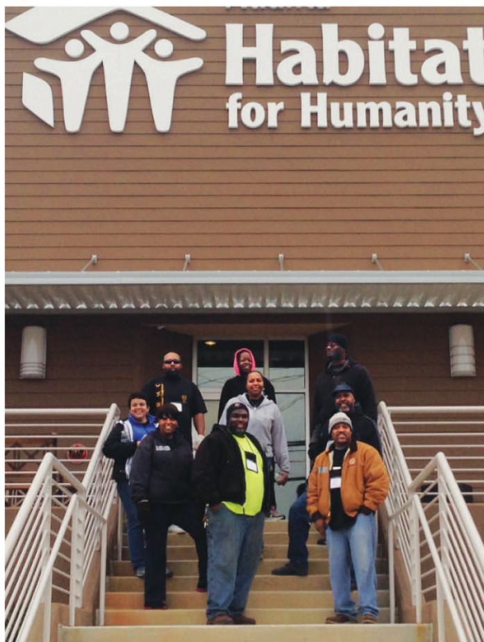
IBEW 21 members work alongside other IBEW EWMC members at a community outreach event in Atlanta.