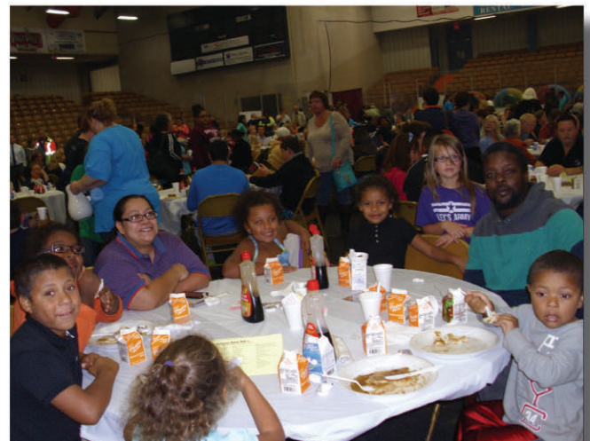
IBEW 21 members from Vermilion County show their solidarity in their support for the Kiwanis at their annual Pancake Day.