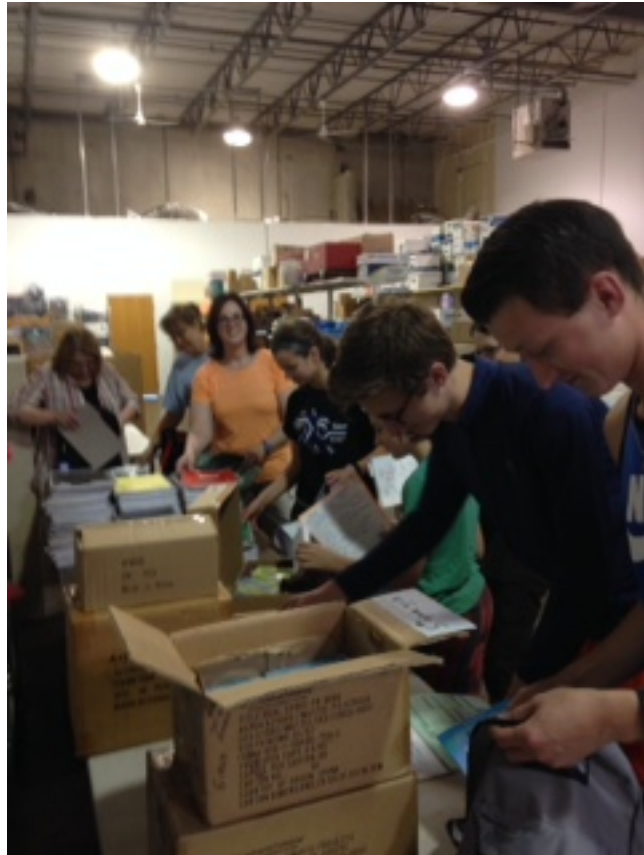
My Joyful Heart volunteers hard at work for the Back to School Gift Event.

Manna Express Gift Cards can take that worry away and participating in the program is easy! Just click here to download the form. You can choose from over 300 stores and choose the amount you want on each gift card. Place your order with My Joyful Heart today. You will have peace of mind and you will help the kids enrolled in our program. All orders are due on September