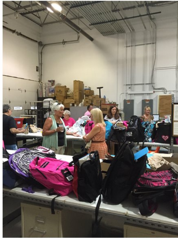
Mokena Chamber of Commerce members packing backpacks during our August 6 Business After Hours event.

If you shop on Amazon, you can now help Amazon send a